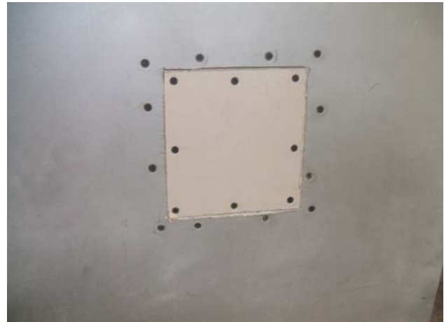
Figure 4. Apply Gypsum Board Patch