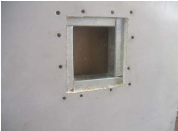
Figure 3. Frame Cutout