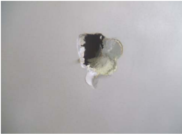
Figure 1. Damaged Gypsum Board