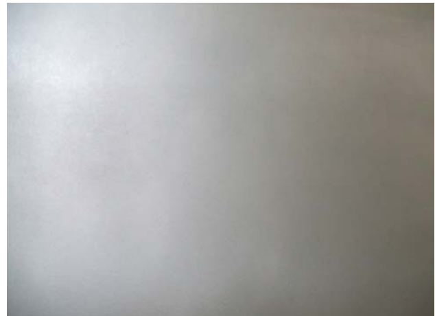
Figure 6. Redecorate Repaired Area

This document may be revised or withdrawn from circulation at any time. The status of the document should be verified by the user prior to following any recommendations contained herein. To verify that you have the most current edition of the document, access the Gypsum Association website at: www.gypsum.org .