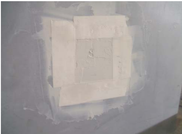
Figure 5. Tape and Finish Patched Area